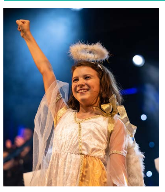
Nativity - BSAPA