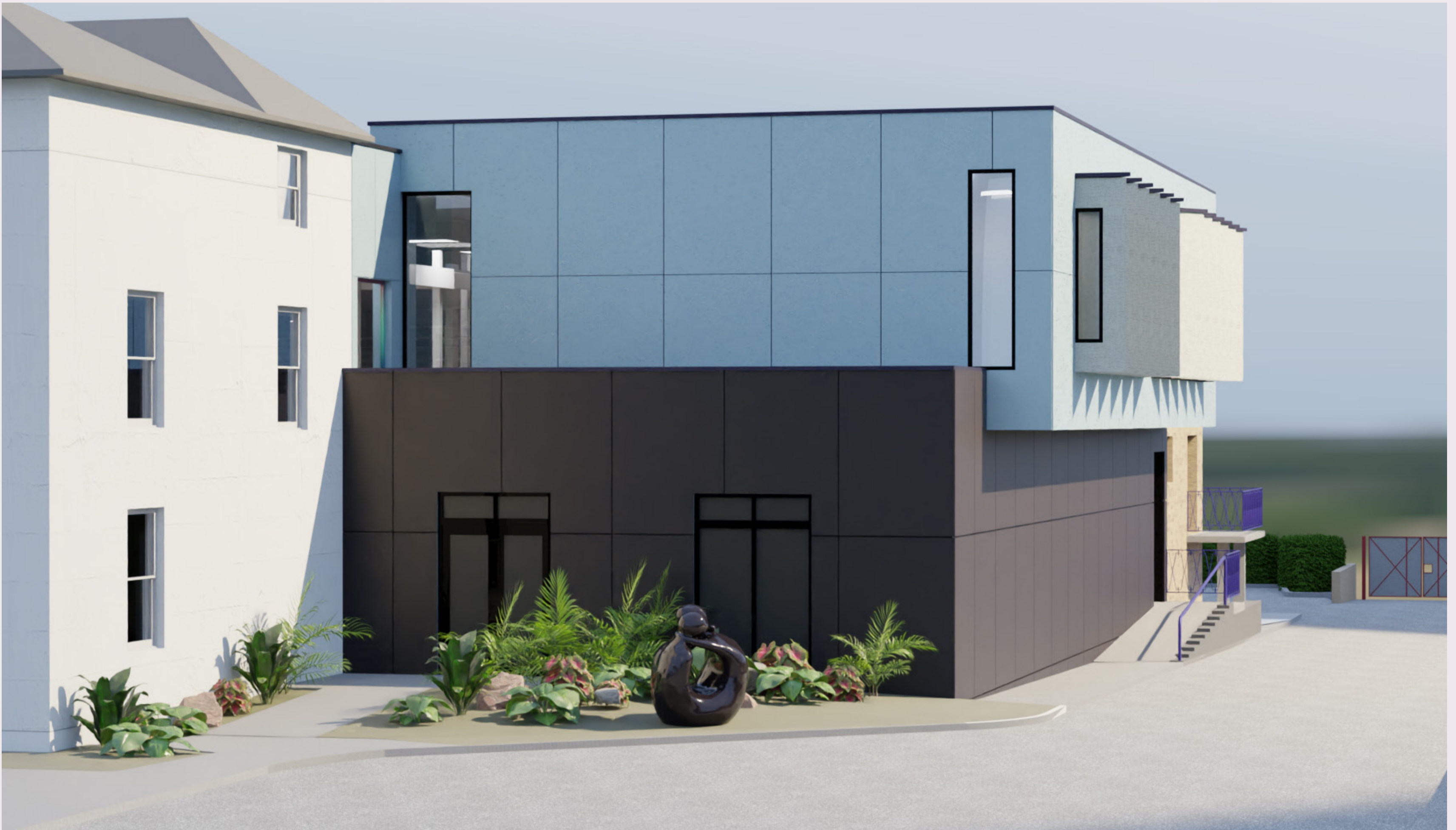
First floor studio extension viewed from South Road