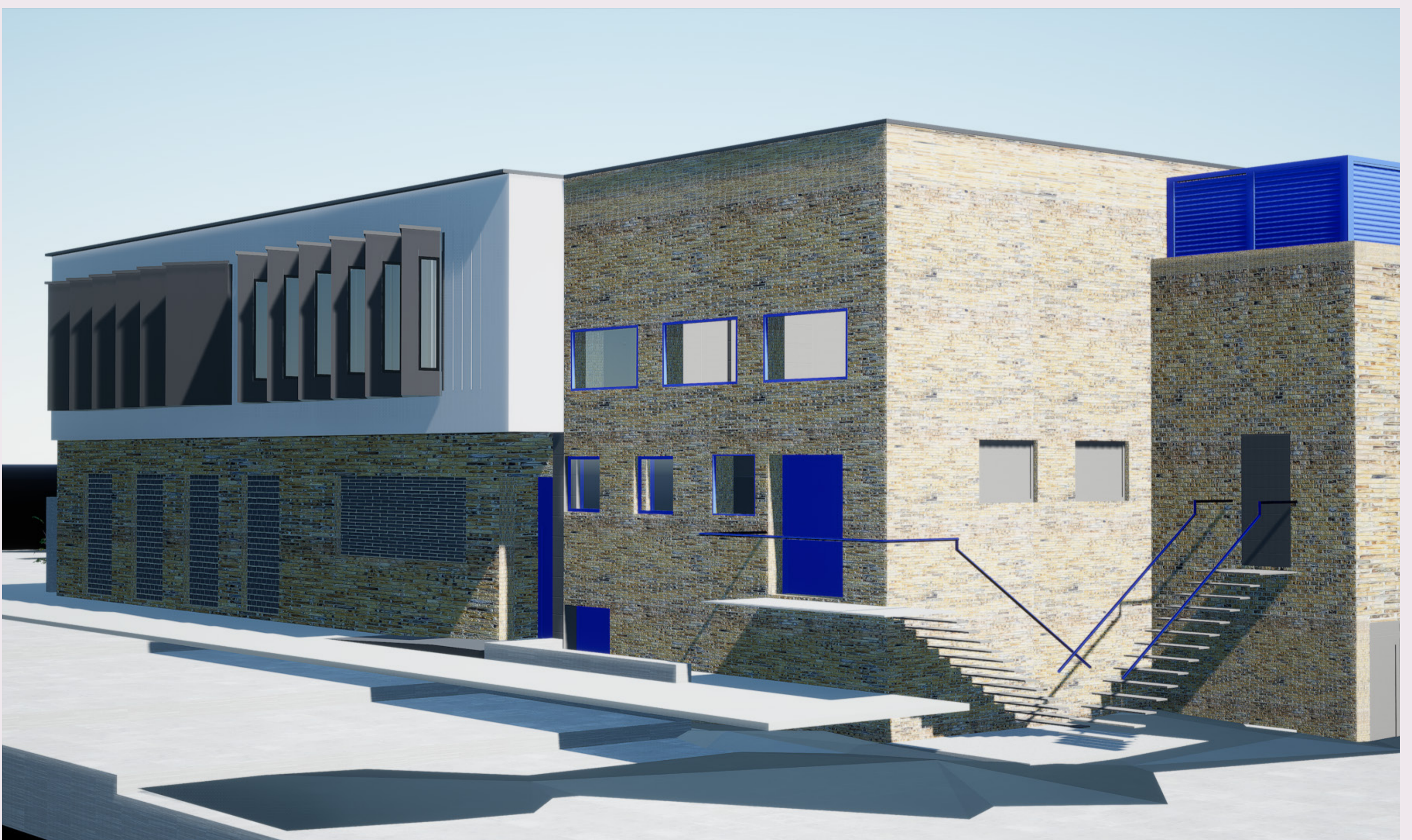
First floor studio extension viewed from South Mill Road